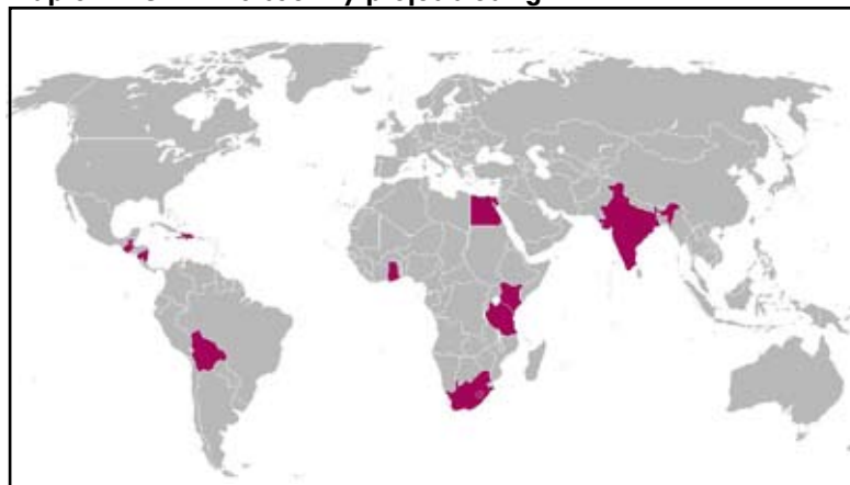
Map of FRONTIERS country projects using AIM

Over the past decade, FRONTIERS has implemented more than 15 projects in a dozen countries that have assessed the feasibility, acceptability, and effectiveness of integrating FP services with maternal and child health, postabortion, and HIV/STI prevention. The purpose of this handbook is to serve as a reference for organizations and individuals that would benefit from methodological guidance when describing, measuring, or assessing