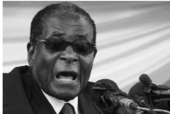
Zimbabwean President Robert Mugabe

To address the political impasse, negotiations between the two parties began in July 2008; former South African President Thabo Mbeki has mediated these talks on behalf of the Southern African Development Community (SADC). All parties signed a power-sharing Memorandum of Understanding in September 2008 allowing Mugabe to remain as president while Tsvangirai would become prime minister. 41 Negotiations have since faltered over the composition and political control of key ministerial posts. During these ongoing negotiations, widespread