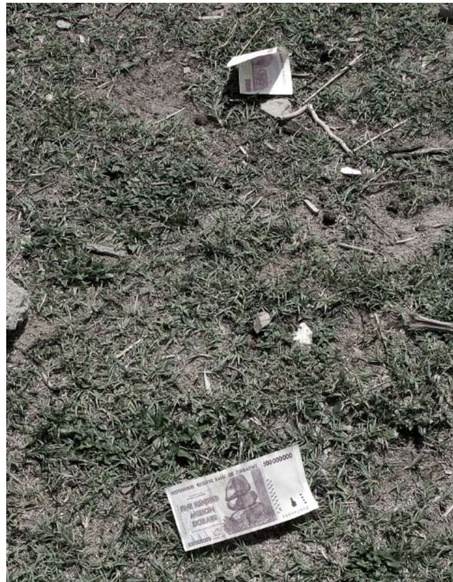
Discarded Zimbabwean 500,000,000 dollar bills.

Hyperinflation has led in part to the unofficial dollarization of the Zimbabwean economy as residents there have extensively begun to use foreign currency alongside (and often in place of) the Zimbabwean dollar. The U.S. dollar has become the de facto currency along with the South African rand, and most goods are only available in foreign currency stores. 57 Until late 2008 it was illegal to buy or sell goods or services in any currency other than the Zimbabwean dollar; however, the government gradually loosened these restrictions, and in November 2008, dollarization became legal when the RBZ licensed selected businesses to sell goods in foreign currency. 58 Today nearly every business accepts