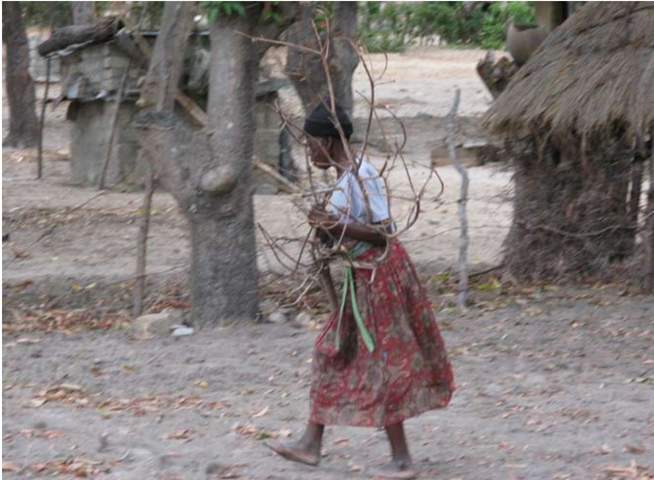
An elderly villager searches for firewood.

require immediate implementation and are not subject to resource constraint. Any failure on the part of the Government, among others, to implement these rights amounts to a violation of the respective right.