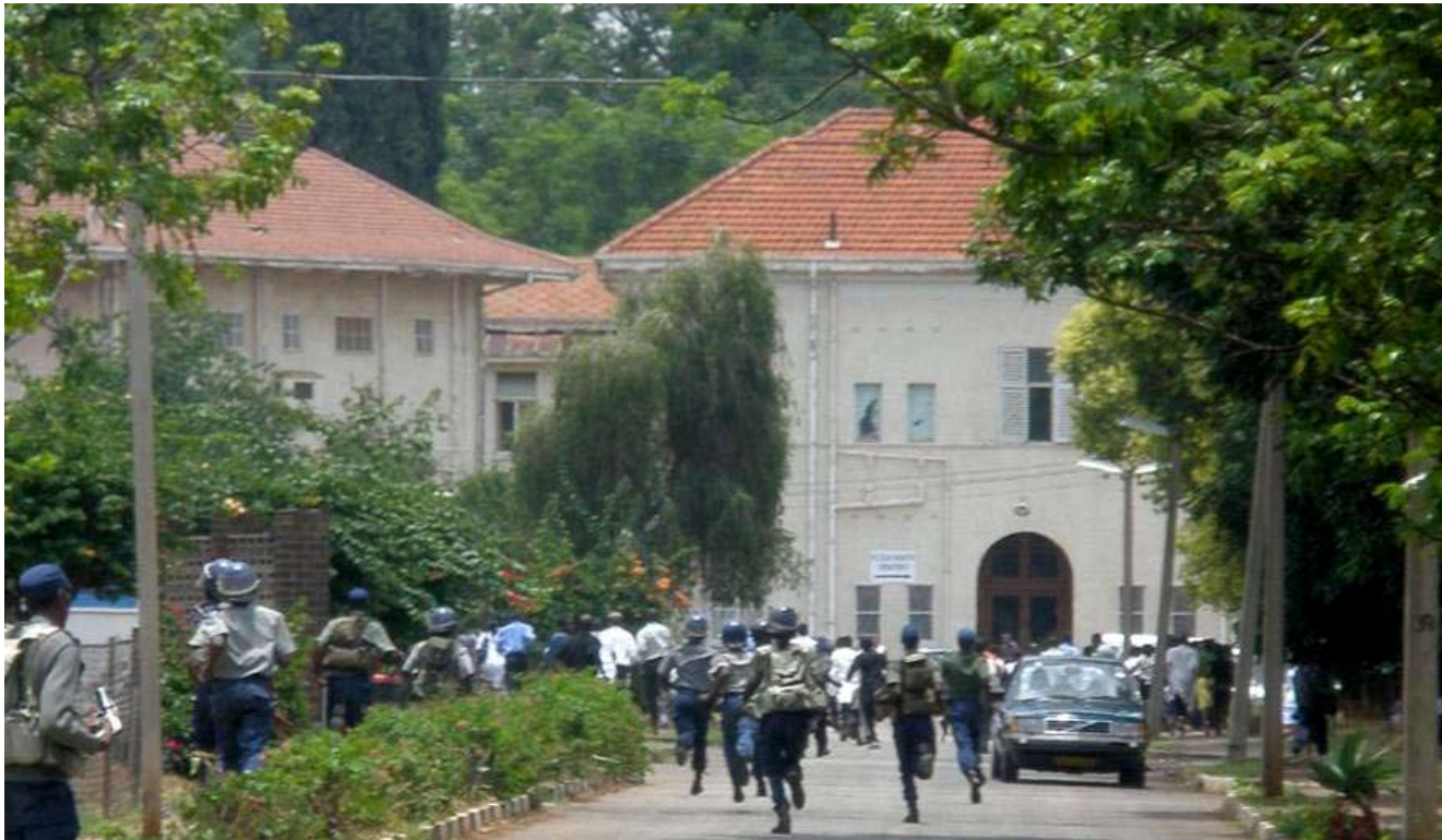
Police chasing health professionals at a non-violent demonstration in Harare on 18 November, 2008.

“Our situation is really bad. We have no running water in the clinic. The toilets are not functioning and we have no proper chemicals to clean them, so the smell is very bad. It is demoralizing to the cleaners to have no proper chemicals to clean the toilets. We nurses have no protection, no gloves, to protect ourselves. The clinic is not clean. We have no way to get rid of our trash. Now that the cholera has started the Red Cross has given us some gloves and some disinfectants, but it is not enough.”