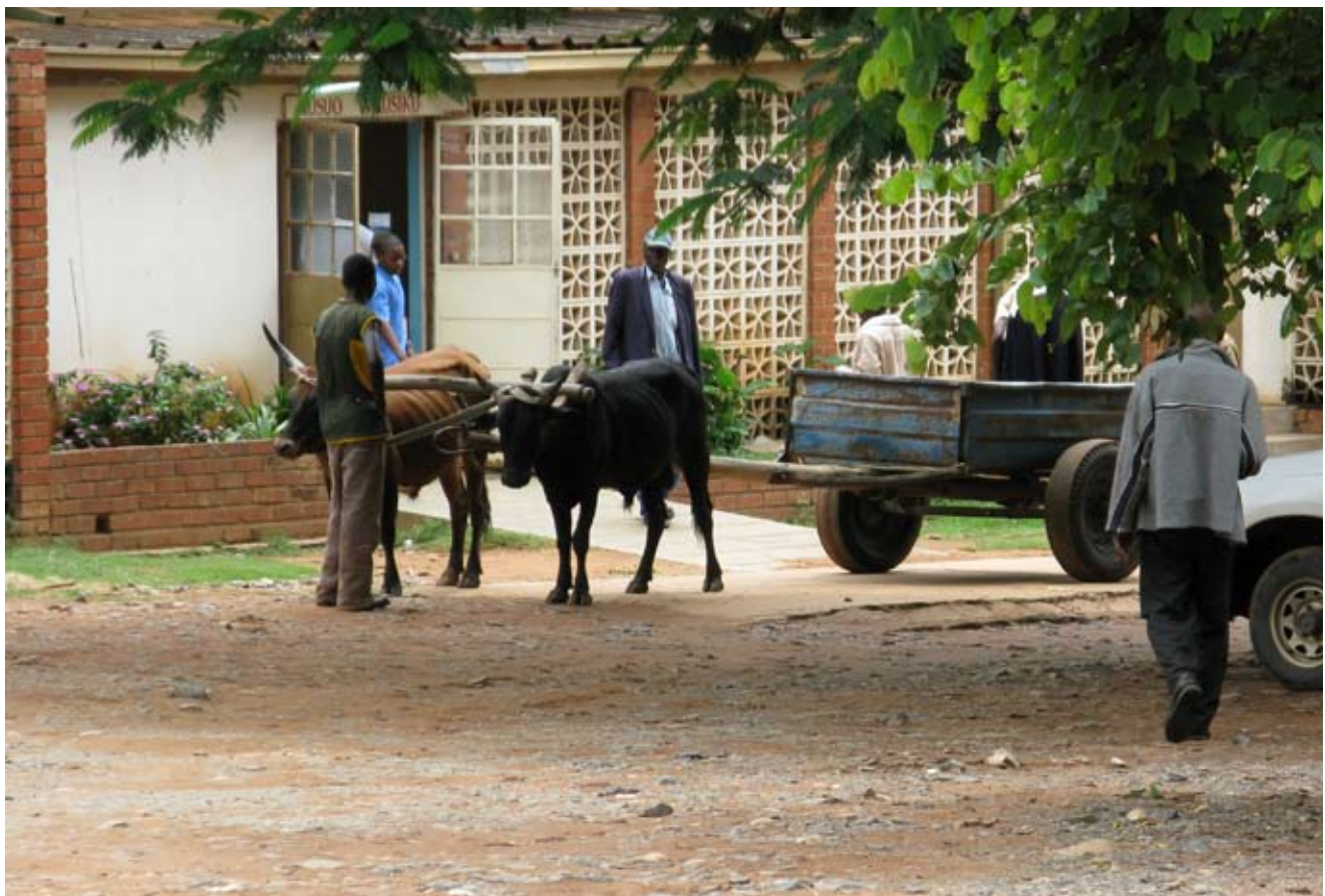
Oxcart used to bring a patient to a clinic.

PHR investigators also visited the medical school library. A handful of students were studying near windows in order to have enough light to read, given there was no electricity. Although the textbook collection appeared adequate – albeit most titles are relatively old – most journals on display were significantly out-of-date.