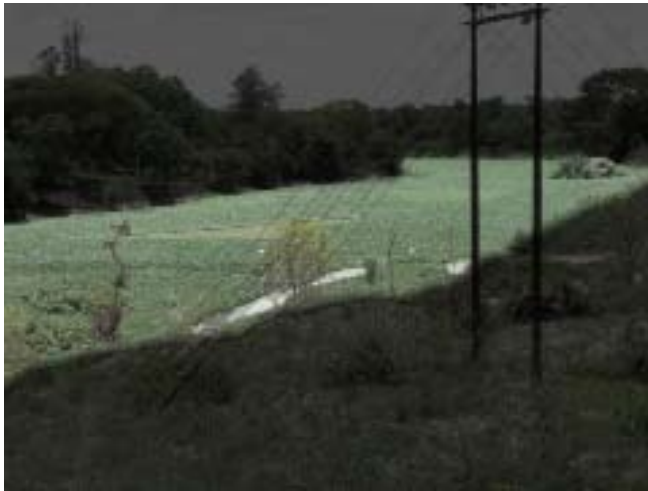
The broad flat band highlighted in this photograph is plant life thriving on biological matter - sewage and human waste - on the surface of a river that feeds into Lake Chivero, Harare's main water source.