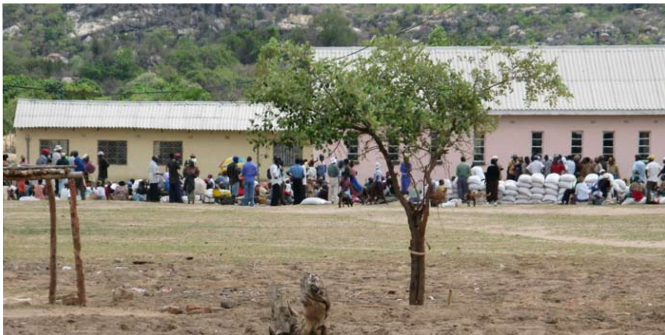
People wait in line to receive food aid.

A senior Ministry of Health official confirmed that one would definitely find wasting and stunting in rural areas. A senior physician at a mission hospital stated