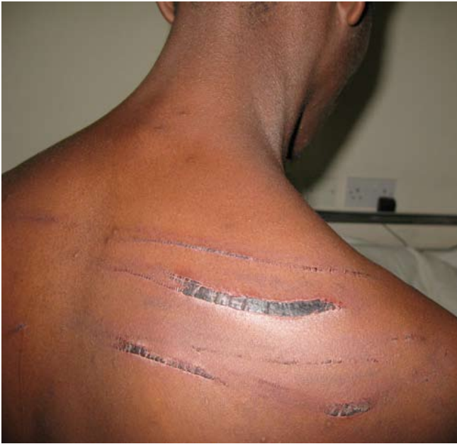
Man shows physical signs of being whipped and beaten.

provinces in Zimbabwe, in both urban and rural areas, and in some of the affected border areas. Provinces visited included Harare, Mashonaland Central, Mashonaland West, and Mashonaland East.