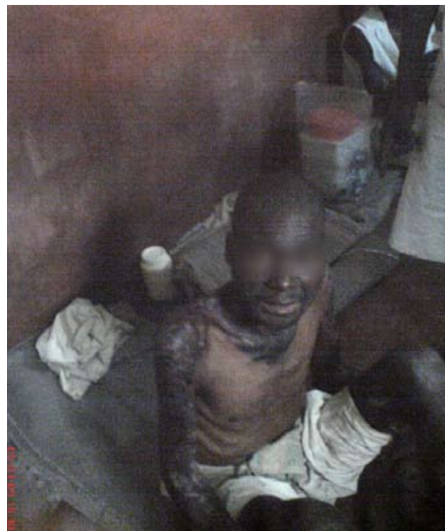
Man showing signs of Pellagra including dark, cracking skin in sun-exposed areas, and wasting. Photograph taken 5 January 2009 inside Harare Central Prison.